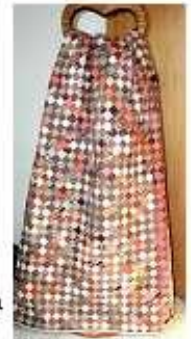
Quilt that was made prior to the Civil War